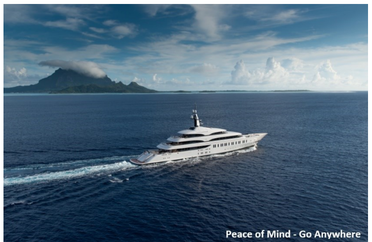
Peace of Mind - Go Anywhere

MSOS is committed to delivering remote healthcare to the highest standard, and continually seeks to improve the safety of those who venture, for work or pleasure, to isolated corners of the world, by constantly evolving all aspects of support, reflecting advances in medical knowledge and practice.